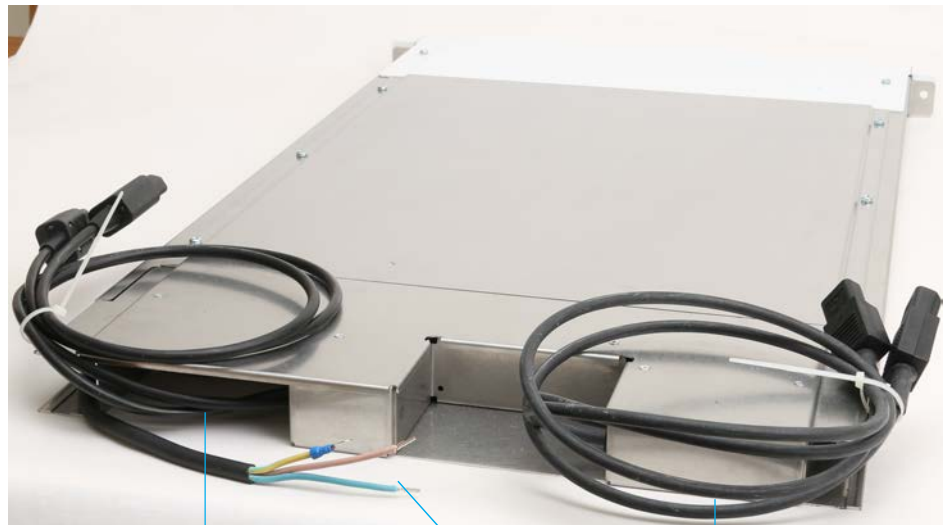
2 x outputs to restricted network