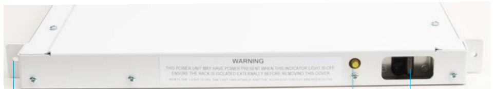
Rack mount fixings