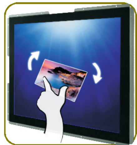
Multi Touch (4points)